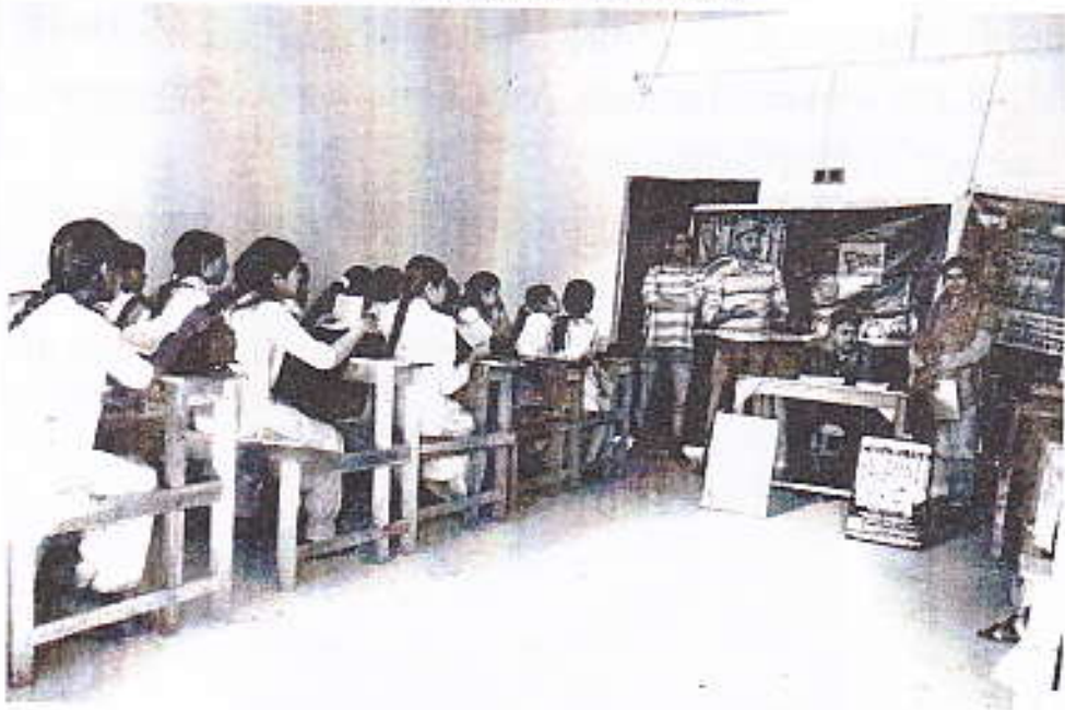
Open house programme with the school children