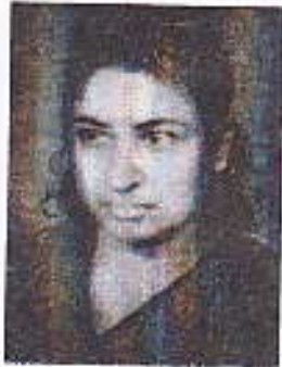
Mrs. Shatabdi Roy (MP) Patron