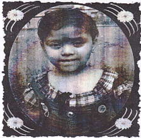
Missing children rescued from Nalhati Rail Station

Every year we celebrate Independence Day, Republic Day, Rabindra joyanti, Netaji joyanti and Saraswarati Puja. Besides this we also organize different awarness programme, games and sports, dance competition and song competition etc, to enhance and encourage the working power of the persons with disability.