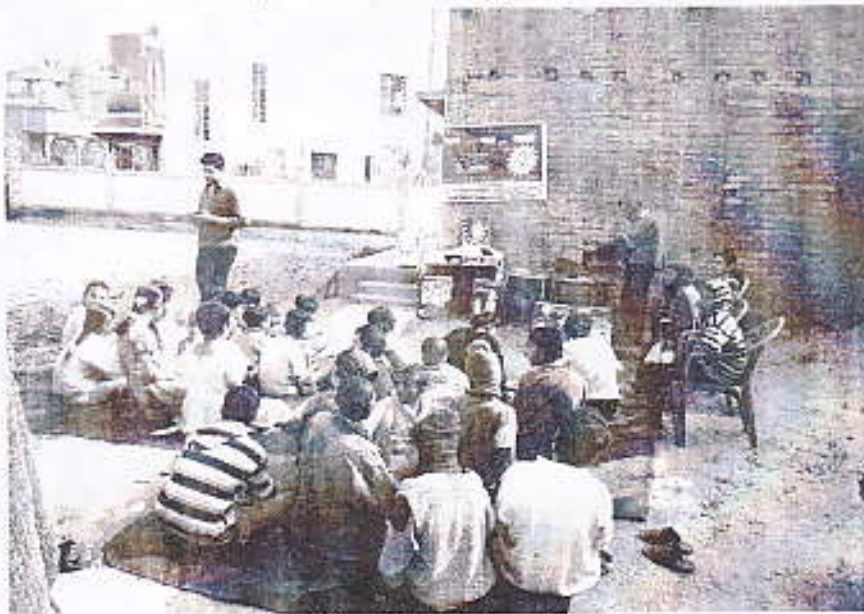
Netaji Birth Day celebration