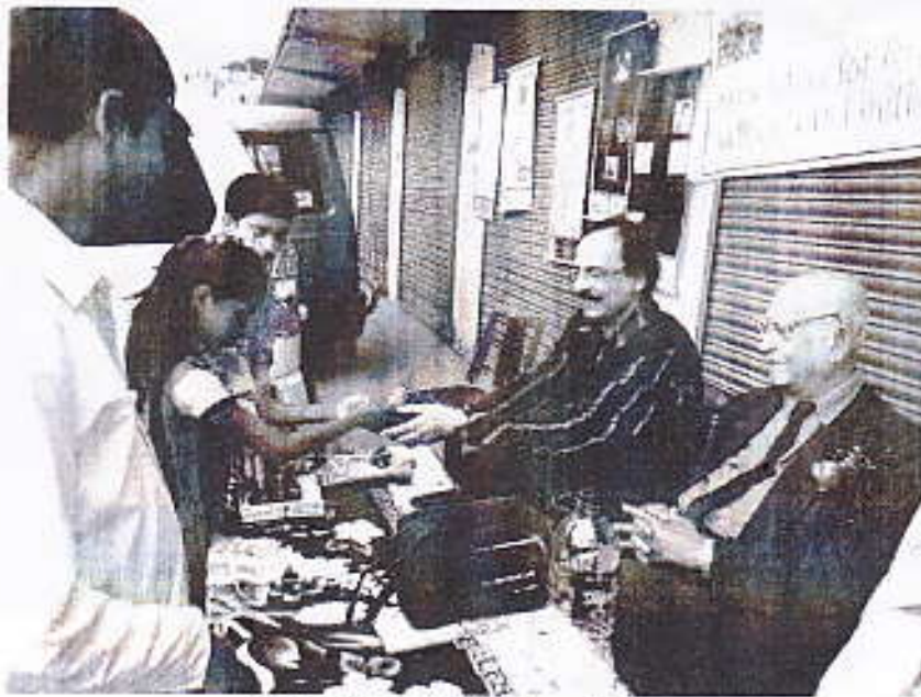
Opening a stall at Tarapith