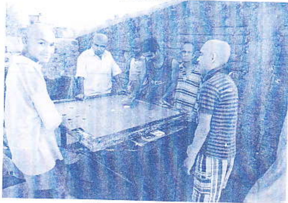
They are playing Caram Board