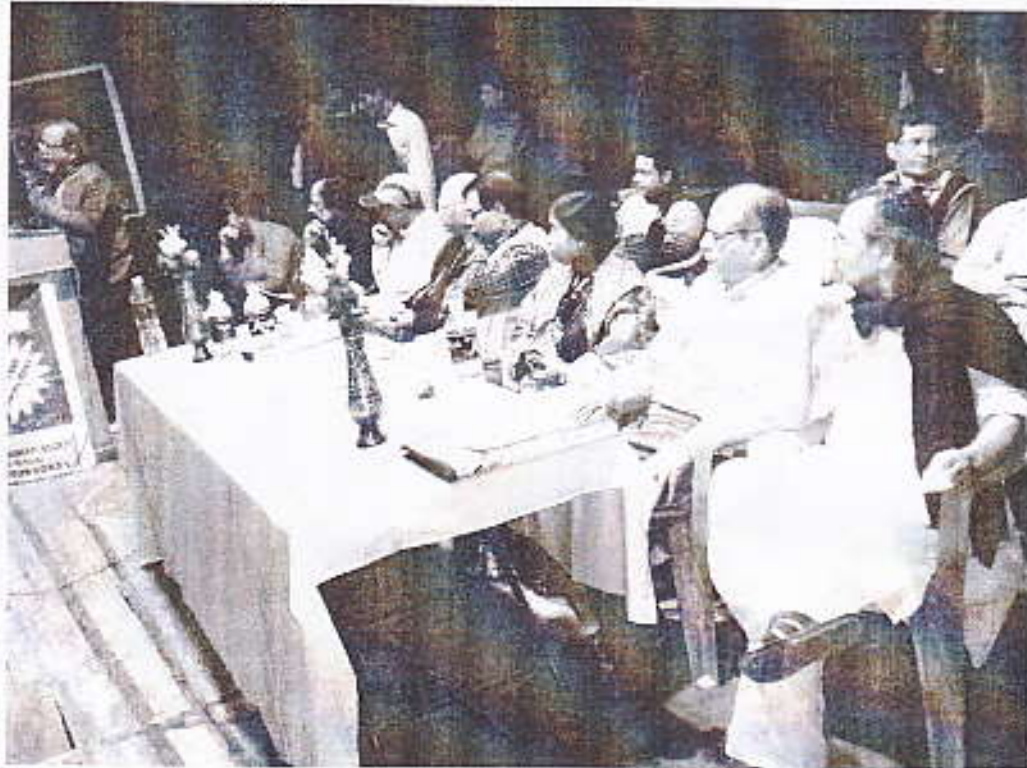
The Hon'able Minister of Edu.& Ayus Dr. Asish Benerjee present at a meeting.

Before the independence "Education for All" was the dream of the National leaders and educationist of our country. This dream is going to be practical through the Integrated Education Programme. Our one of the objective is also to promote Integrated Education Programme for the children with disabilities .As it is believed that persons with disability can take education with the normal students. The integrated education policy has been taken up by the government, to materialize this aims and objectives .The society is working all over the district of Birbhum. The disabled children are getting scope to take education with normal students of primary and secondary schools. Every year we get admitted some beneficiaries from our special school to normal school for general education.