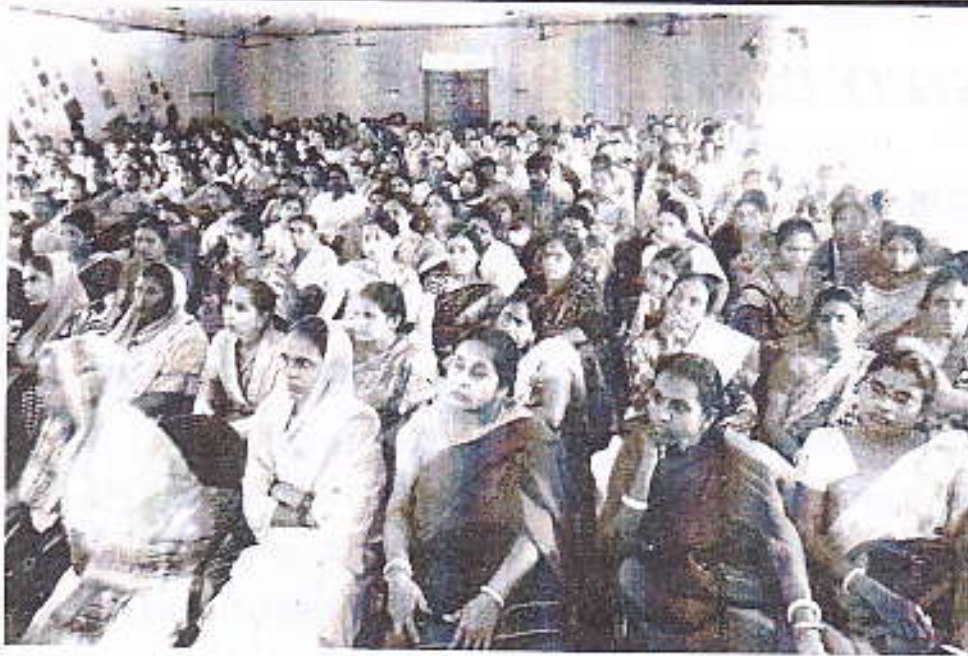
Awareness on Child Line