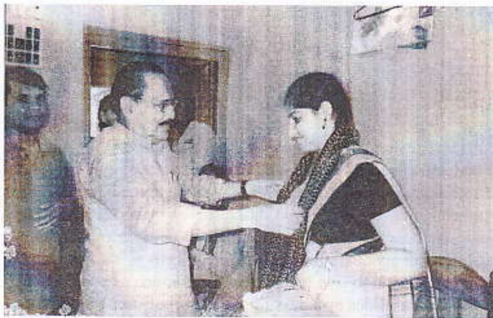
Welcome to our guest