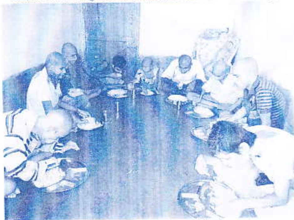
The beneficiaries are eating their lunch