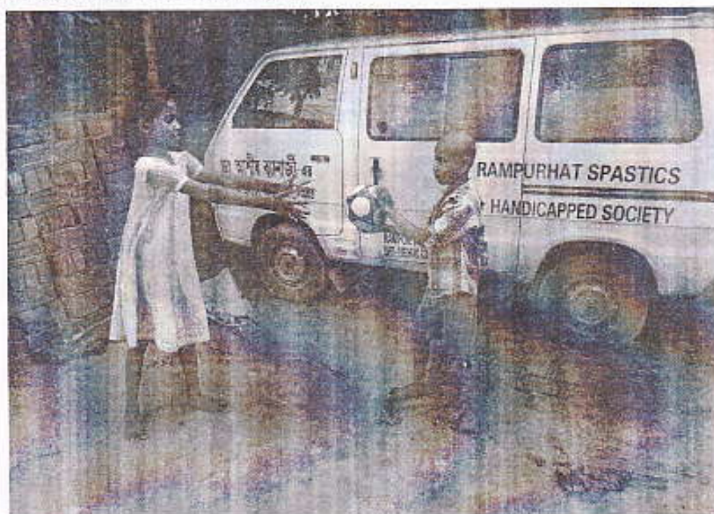
They are throughing ball

We have been continuing this unit with the support of public donation from its very beginning period. At last the ASHADEEP SPECIAL SCHOOL was sanctioned in the financial year 2006-07 from 1 st June, 2006 and the Ministry of Social Justice & Empowerment sponsored for 39 beneficiaries under the "DEEN DAYAL Rehabilitation Scheme". In the year 2012-13 Ministry also sanctioned grant-in-aid against 60 beneficiaries and the last year (2014-15) we provided the services to the 40 beneficiaries. Now the organization has been reached at a significant place. Teaching disabled students is a complicated task because of their various problems and difficulties that is a challenge to the teachers. Persons with disabilities are generally benefited from careful approaches of special teachers/educators by way of precious teaching and direct instructions. Precious teaching involves planning, using and analyzing the effect of instruction techniques.