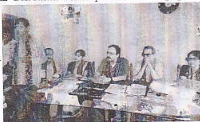
The secretary delivering his speech about the background of the organization

The organizations provided services to the persons with disability with great sincerity and responsibilities. As a result, in the year 2003-2004, The national Trust gave National Award for the "Best Residential Care Centre" and The national Trust gave a National Award to the secretary as a Best Parent in the year 2008-09. In the 2009-10, the National Trust awarded our institute as "Best Shelter Workshop" and "Best Emerging Venture" in 2010-11 and the West Bengal Government gave recognition to our organization as the "Best Institute" in the same year.