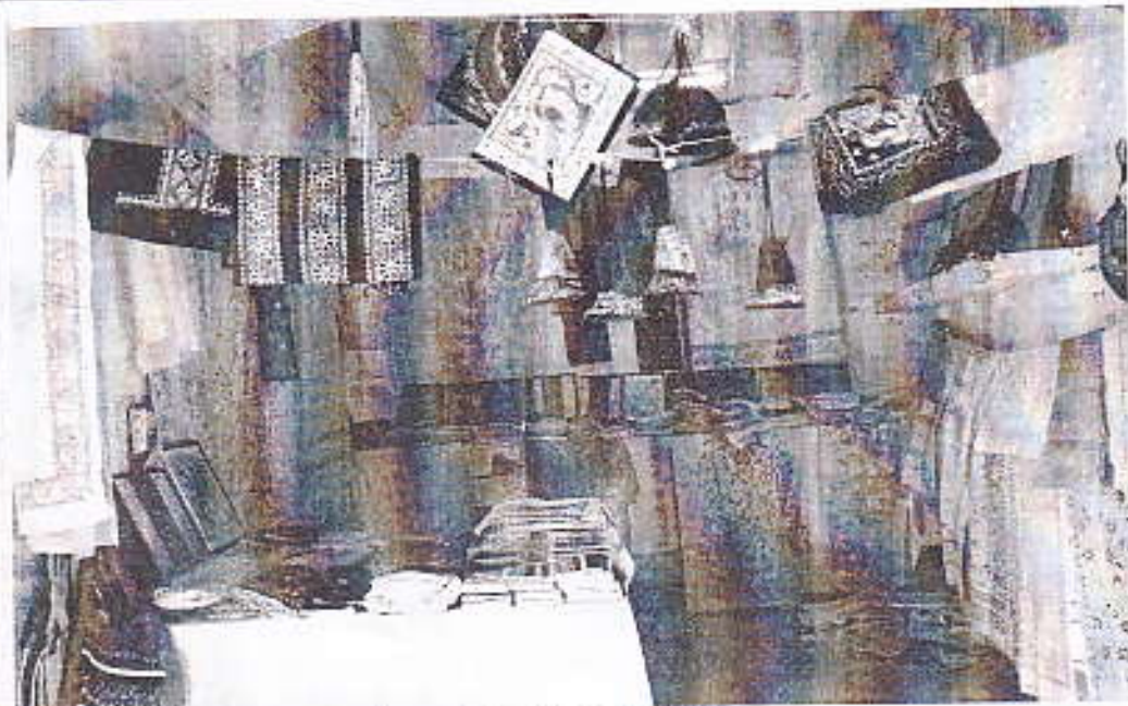
Our stall at INA Delhi Hat