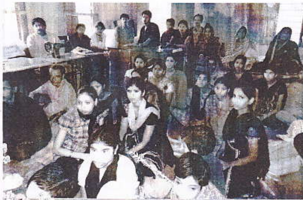
Group of ARUNIM worker.

To maintain and develop in physical area we provide physiotherapy so that beneficiaries may use their optimum strength. All the educable children participate in educational session regularly. To makes them independent in the area of daily living activity. Children are taken under planned programme for the development in the areas of functional, social and emotional. They participate in play session. Besides these we arrange regular vocational training session for those who are fit for this level. We are successfully running the project ARUNIM launched by the National Trust.