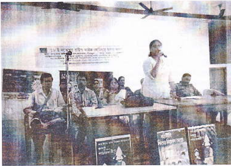
The B.D.O Rampurhat -II delivering her speech about Child Line