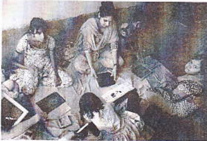
Our beneficiaries are attentively reads during the class.

Our Organization has been running a Special School since July, 1999 named "ASHADEEP SPECIAL SCHOOL" for the child with Mentally Challenged (MR & MD). It is worthwhile to mention here that our unit is the only Special School for these children in the backward district of Birbhum. Two types of services are provided namely, Non-Residential and Residential set up. The total 12 nos. of staff are engaged in this service. Its present roll strength is 40 (Forty). The special school runs Monday to Friday. We keep attention to the beneficiaries on Physical Management, Behavioral Management & trying to achieve their cognitive developments and personal, social activities for the children with mental retardation and multiple disabilities. We trained up the students on their educational & Prevocational area and give special inputs for the improvement of the communication skills. We also try to integrate sense organs by providing stimulation of music, light and touch through playing & dancing etc. We have got success to develop some children mentally and physically by providing them education and physiotherapy. We put into work some children with Mental Retardation (MR) in different skills like kantha stitching, tailoring, packet making, cooking and plantation that will facilitate the process of rehabilitation in future.